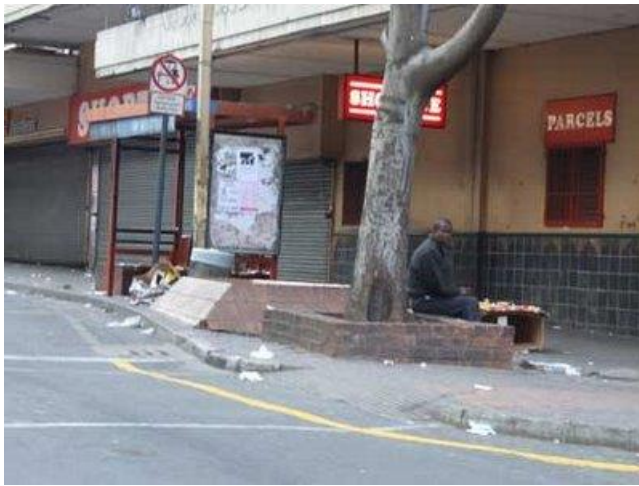
Eloff Street, Johannesburg

The 2002 edition of the South African Monopoly board underwent a serious makeover, where a lot of the traditional SA properties were swapped in favour of more exclusive real estate. Streets in Durban, Bloemfontein, Cape Town, and Johannesburg were replaced with cities, neighbourhoods and landmarks. Eloff street in Johannesburg (which, while it had become a less “desirable” property investment option, was still one of the more expensive streets in JHB), West and Smith streets in Durban and Long and Strand streets in Cape Town, no longer featured on the 2002 board. These spots were replaced by Plettenberg Bay, Franschhoek, Hyde Park and Sandton. Boksburg, Mitchells Plain and Soweto also featured on the board. Snapping up property in Clifton, the prime property suburb on the board, would set you back R40 000.